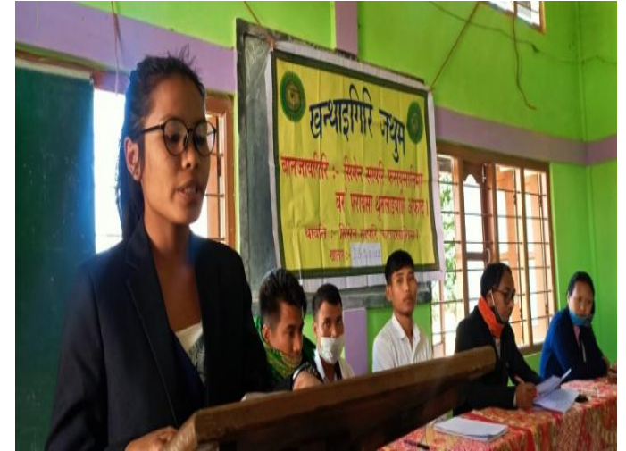
POET MEET Date: 28-01-2022