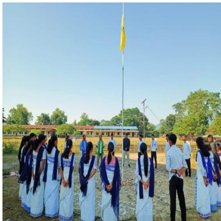
FLAG HOISTING 71 st Foundation Day Celebration, BSS 16 Nov/2022