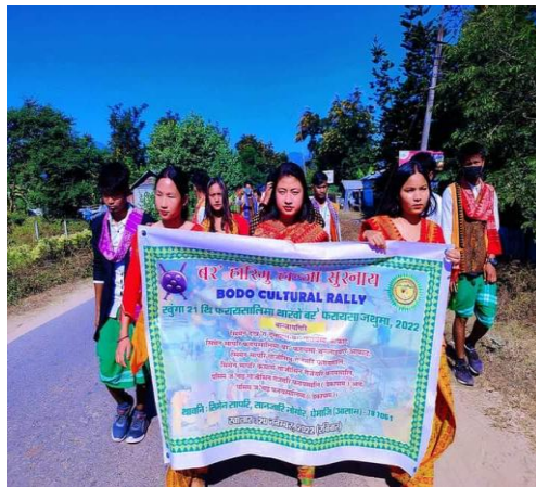
CULTURAL RALLEY 21 ST Boro Student Meet 20 Nov/2022