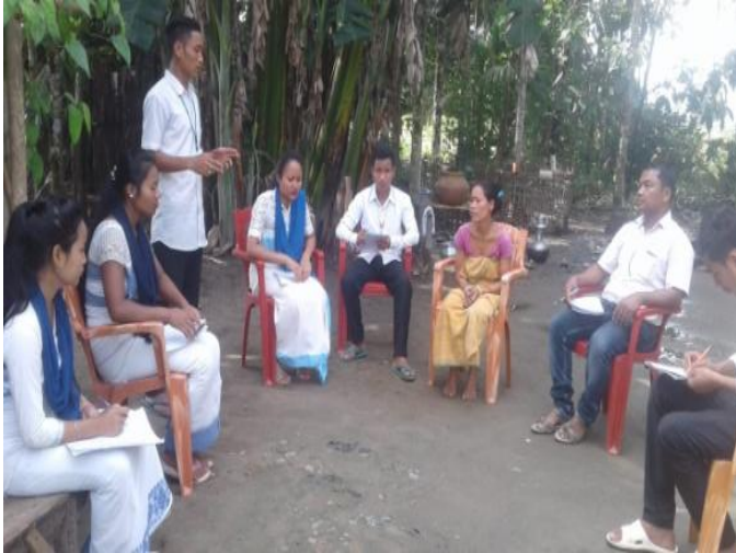
CLEAN INDIA MOVEMEN: 2018 Door to Door Awareness Programme At Burabhakat village, Simen Chapori, Dhemaji, Assam