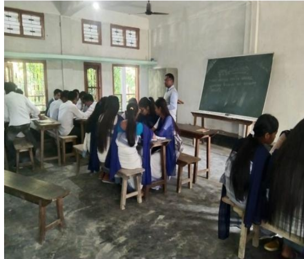
GROUP DISCUSSION 5 th Semester Date: 05-01-2022